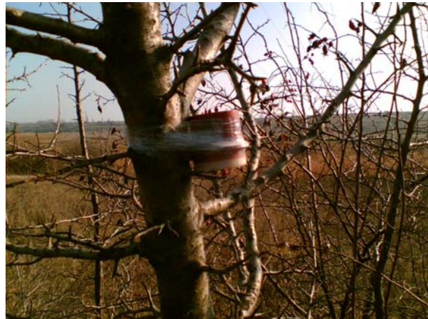
Fig. 2. Tailings Sukhachevskoye. Placement of track detectors cup.

To determine the average value of the F for the conditions of the tailings under research, we have carried out pair measurements of radon-222 and its decay products in the air. As we know, the F can be presented by the ratio of equivalent equilibrium concentration (EEC) of radon-222 to volume activity of radon-222 in air. This factor characterizes the displacement of the equilibrium between the mixture of short-living daughters of radon and their parent nuclide. Consequently,