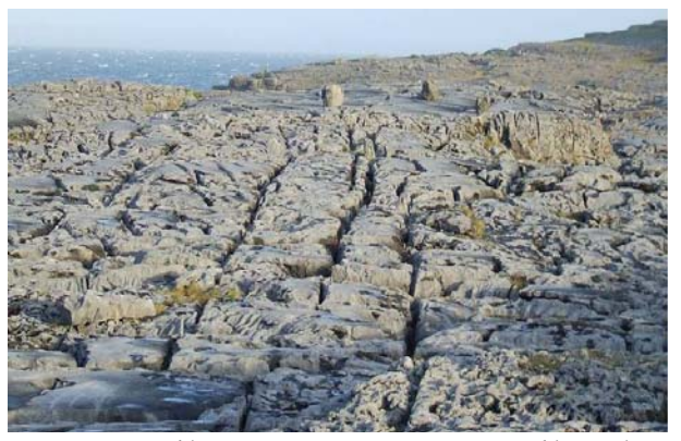
Fig. 2. Exposed limestone pavements separated by grykes.

The house in question is located in an area of limestone interdigitation, a finger-shaped piece of land, covered in a thin layer of soil, from which the shale has been removed. The three different geological layers are all likely to have an impact on radon movement through the ground and ultimately on indoor radon concentrations. Radon-222 is part of the uranium-238 decay series and, since granite is relatively rich in uranium, it is often associated with elevated indoor radon concentrations [3]. Both shale and limestone can act as a conduit for radon as it can easily pass through cracks and fissures in