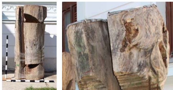
Fig. 3. Large wooden sculptures affected by woodworms from the “Nicăpetre” collection.

Microbiological tests (before and after treatment) were only conducted on paper documents and for items in the mixed collection. The results are presented in Tables 3 to 6. Microbiological tests were only conducted to estimate the decrease in the size of the actual microbial population after treatment. To meet the general goal of the treatment, the worst case scenario was taken into consideration; as such, the most contaminated specimens were sampled according to visual examination. One should be aware that