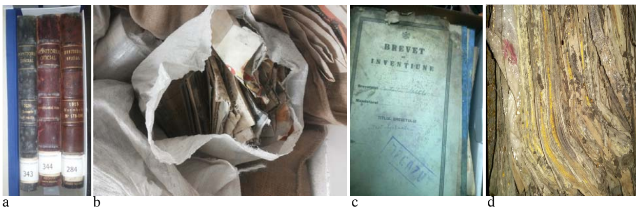
Fig. 2. Documents highly affected by fungi: (a) volumes with leather covers from the “Official Journal Collection”, (b) bags containing items from the “Museum Inventory”, (c) patents from the “Royal Patents Collection”, (d) documents from the “Sahia Film Archive”.

ASTM 51538) [38]. In the case of collections packed in carton boxes or bags (paper, mixed), the ECB ampoules were placed in the maximum and minimum positions (known from operational qualification of the irradiator) of each tote box. ECB dosimeters were measured by oscillometric readout method (Radelkis reader – Institute of Isotopes).