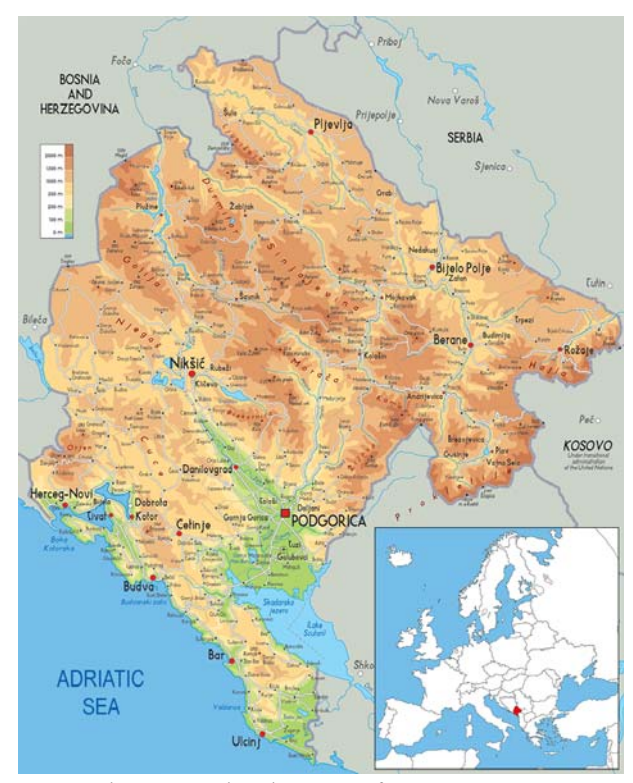
Fig. 1. The geographical setting of Montenegro.

education of children with special needs is carried out) and student dormitories. These institutions are located in 519 buildings all over the country.