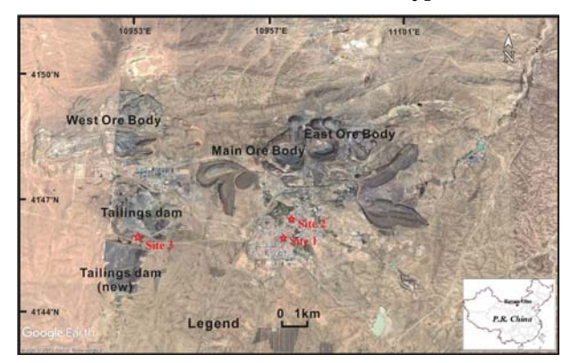
Fig. 2. The survey locations map of Bayan Obo District.

The Bayan Obo Iron-Rare Earth-Niobium Deposit is located 150 km north of Baotou City, about 18 km long from east to west and 3 km wide from north to south. The Bayan Obo living district is located about 2 km south of the main mine of the Bayan Obo iron mine, which area is about 3 km<sup>2</sup>. In 1997, the town had a population of about 30 000, but now less than 20 000. We selected three types of build-